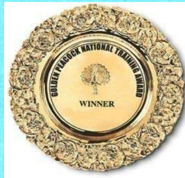
Golden Peacock National Training Award -1998