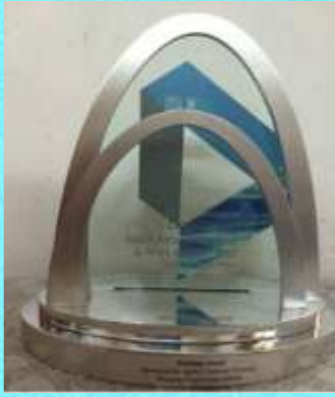
Training Award' 2017 at the Lyods Global List