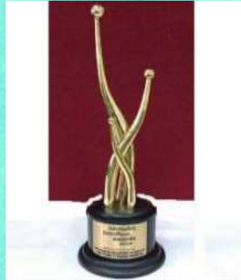
Samudra Manthan Award for 'Institute of the Year' -2016