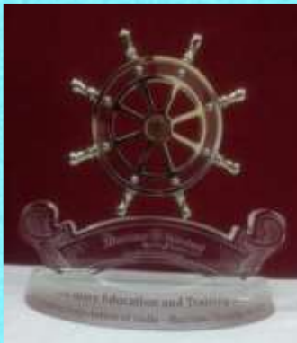
The Maritime Standard Award (TMSA) 2017